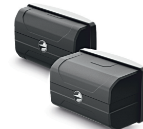
Thermal Imaging Binoculars Accolade 2 LRF

The device's innovative battery-release mechanism ensures fast, flawless battery changes. Rechargeable IPS7 battery packs provide up to 10 hours of continuous operation.